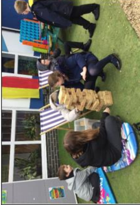
Together the children played games, taking turns, making a tower out of jenga blocks. Whilst some children looked on relaxing on the deck chairs.