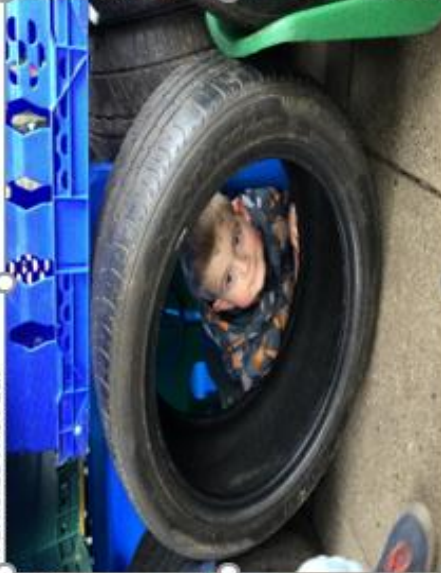
Being creative with chairs, wheels and crates the children showed creative, imaginative play to make a car.