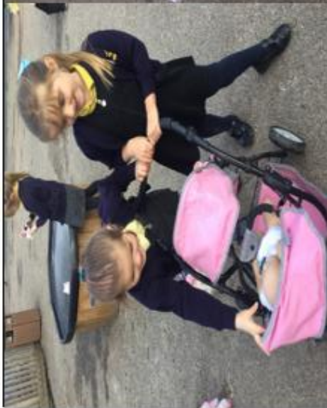
On the small world playground enjoyed using their imagination through role play