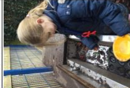
The pots and pans were very busy in Outdoor life with lots of baking. On the menu were mud Pies, Chocolate brownies, cakes and mud soup.