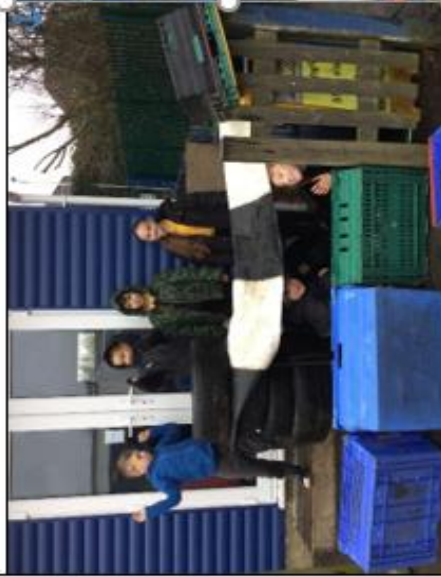
Using crates, tyres, rope and tarpaulin the children made a den using creative play.