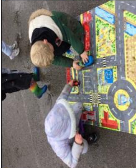
The children enjoyed playing with trains and cars. Using different textures to see how the vehicles moved.