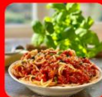
ITALIAN PASTA SAUCE