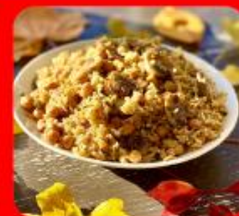
MIDDLE EASTERN PILAF